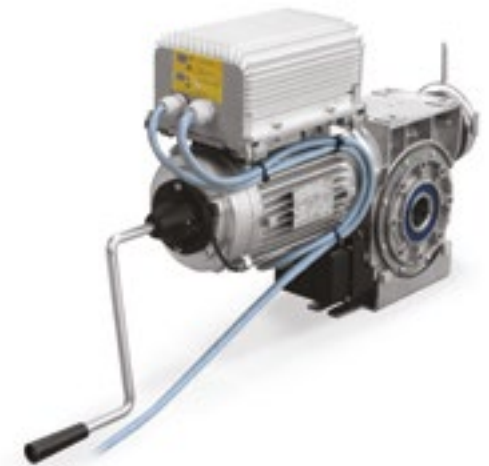
HDFI WITH INVERTER ON BOARD for high speed doors