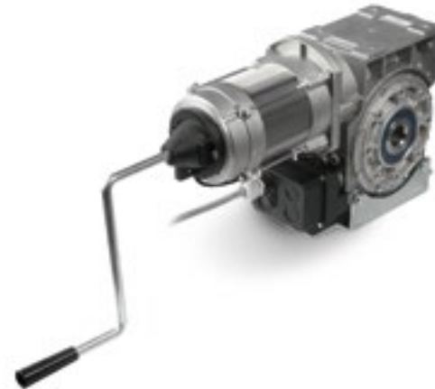
RDF for rolling doors