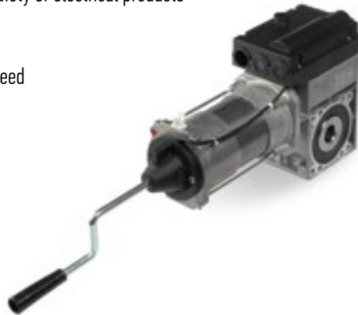
SW/SD for sectional doors

Convenient and practical solutions, also offered in kits including everything you need for a 100% Nice installation.